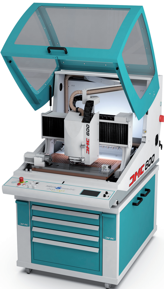
MINI CNC MACHINING CENTRE - DMC II