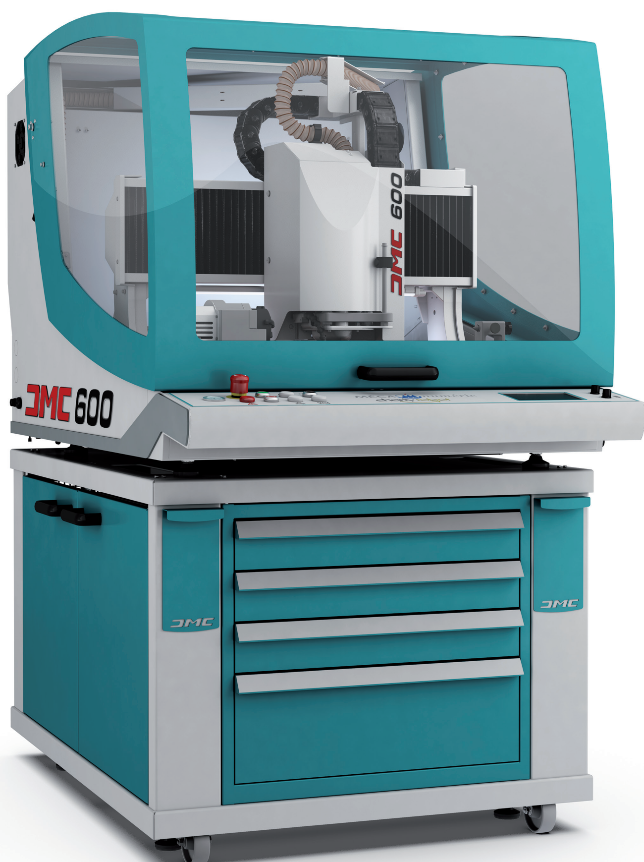
▲ MINI-MILLING CENTRE - DMC II