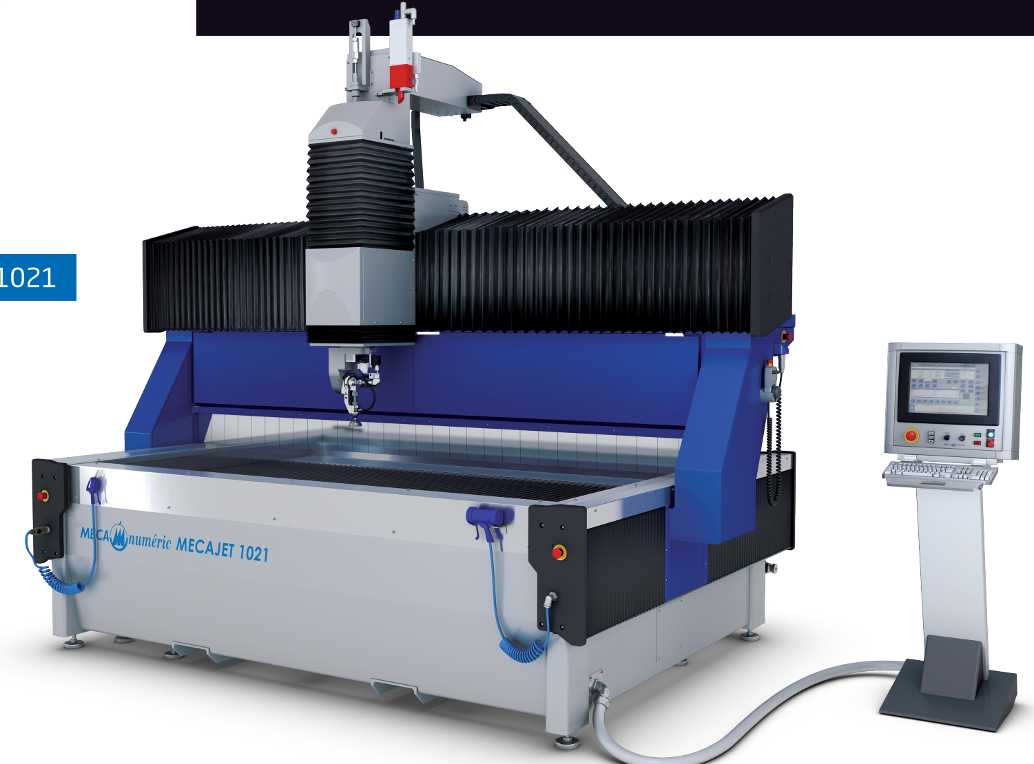
WATER JET CUTTING - MECAJET 1021