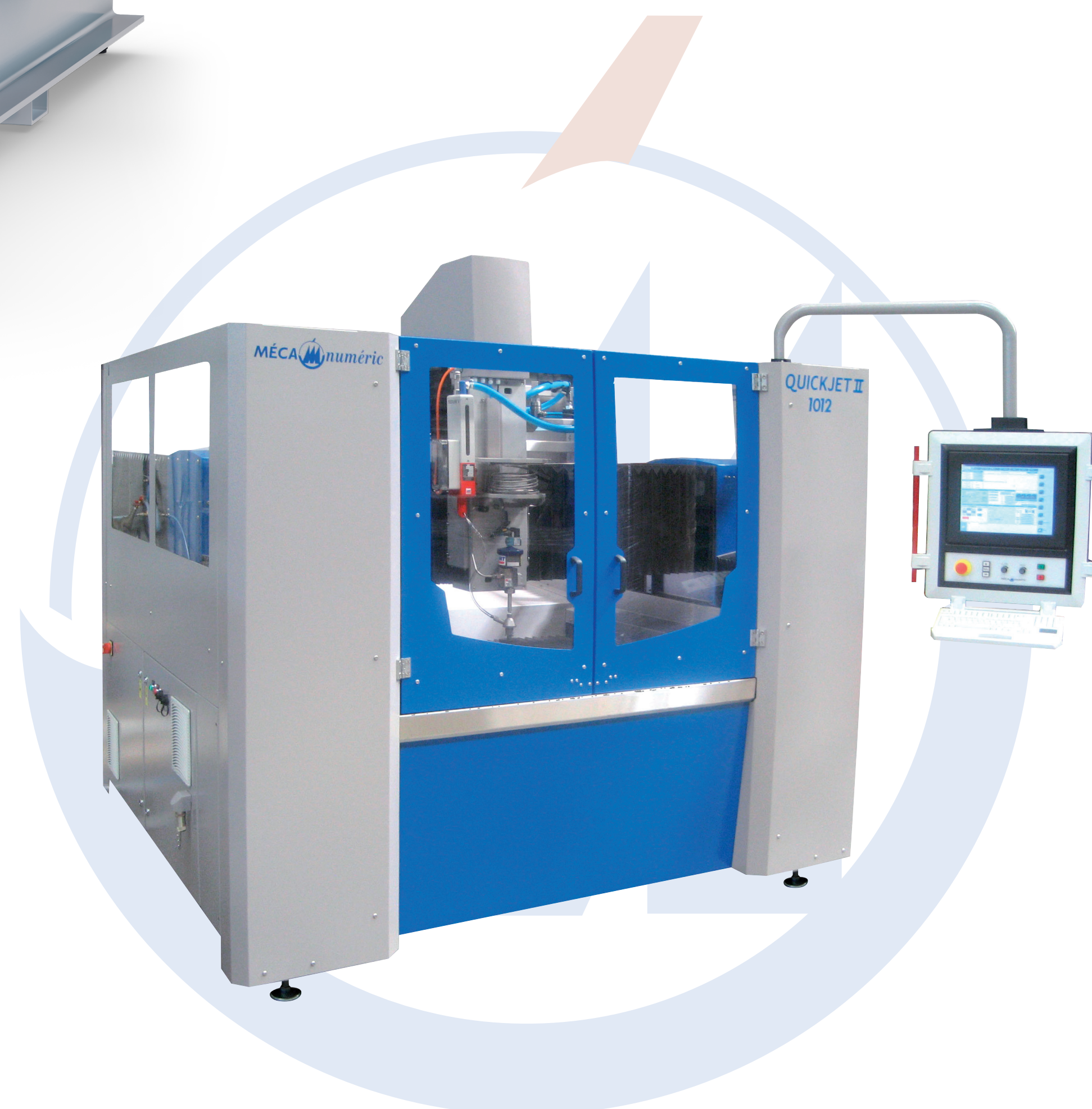
WATER JET CUTTING CENTRE - QUICKJET