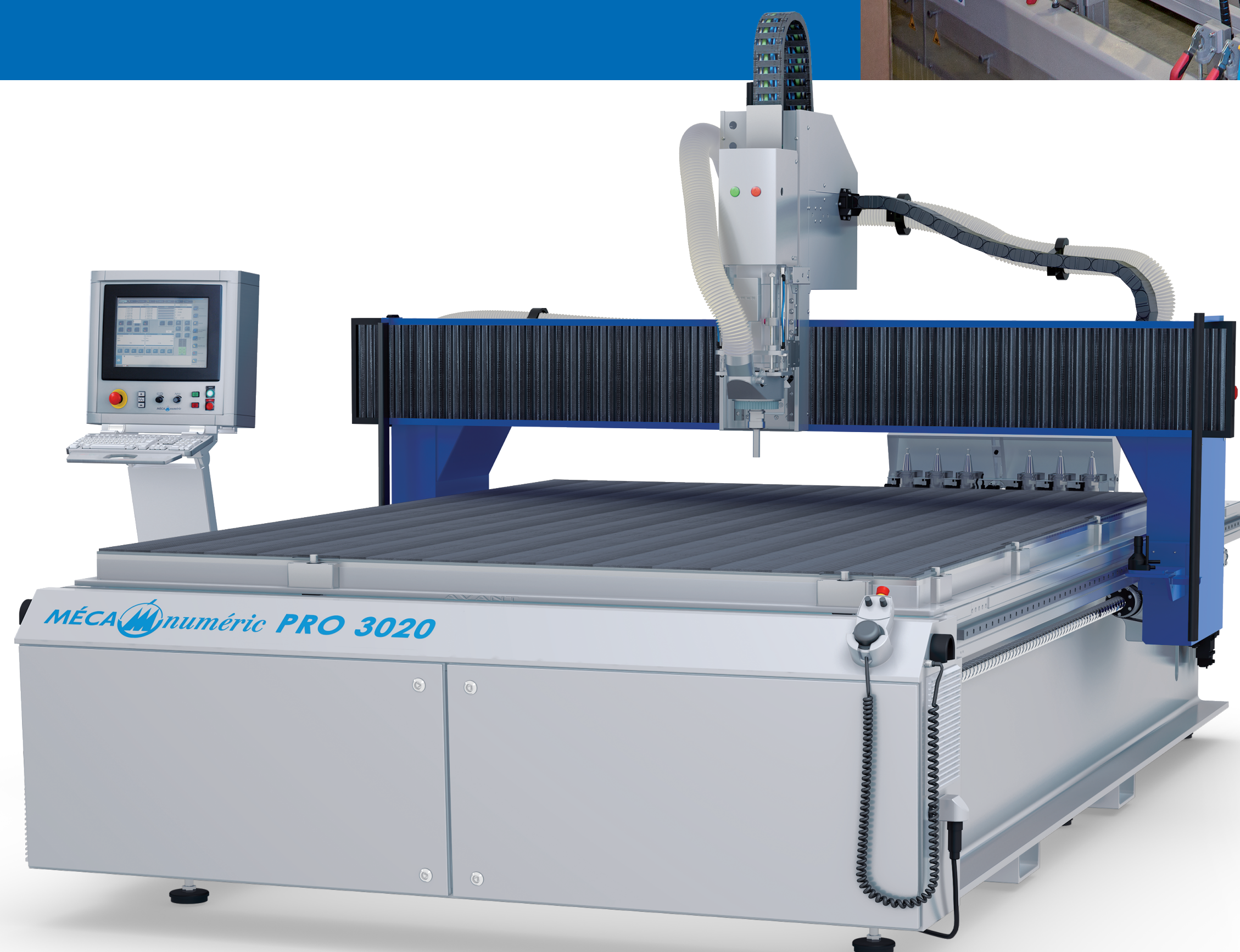
VERSATILE MILLING - MECAPRO