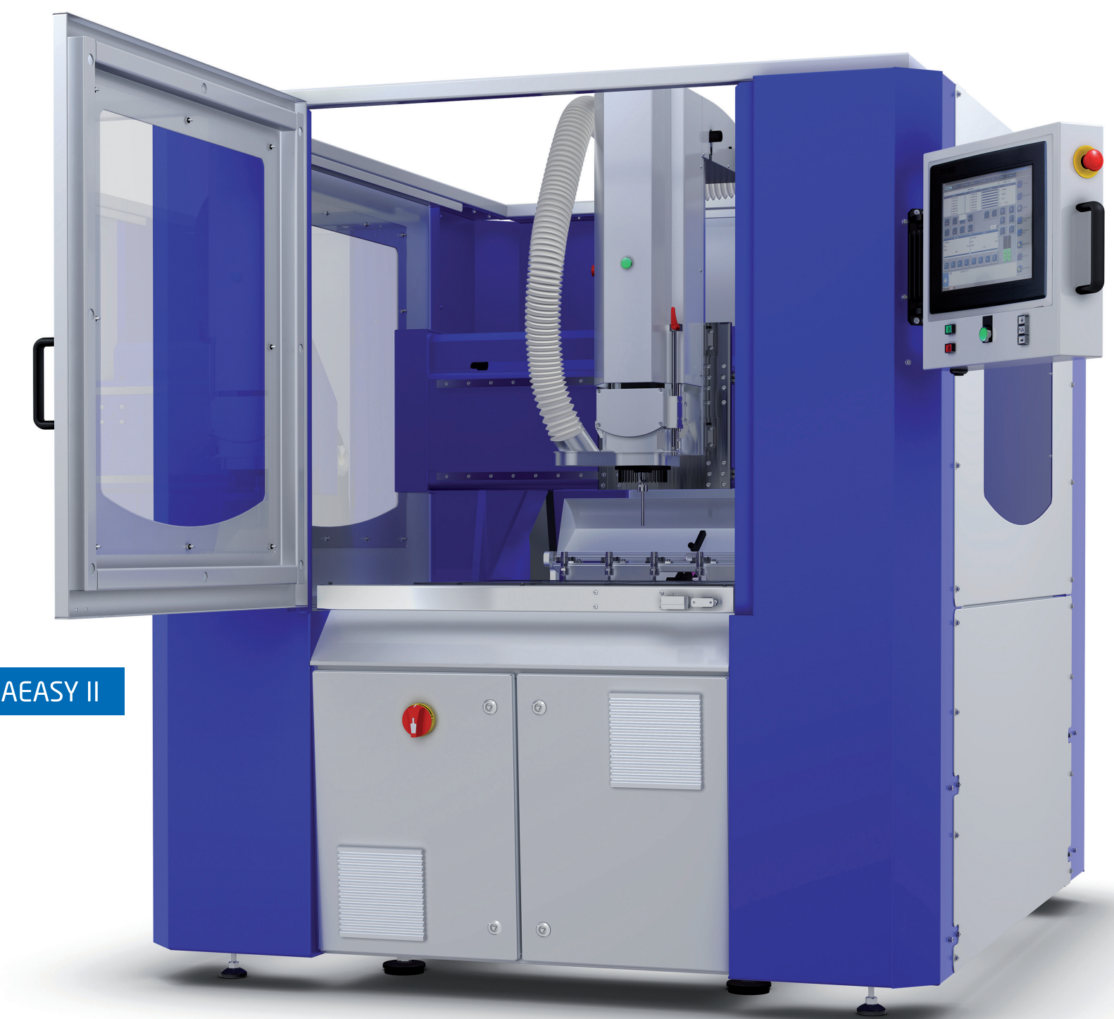
VERSATILE MILLING - MECAEASY II