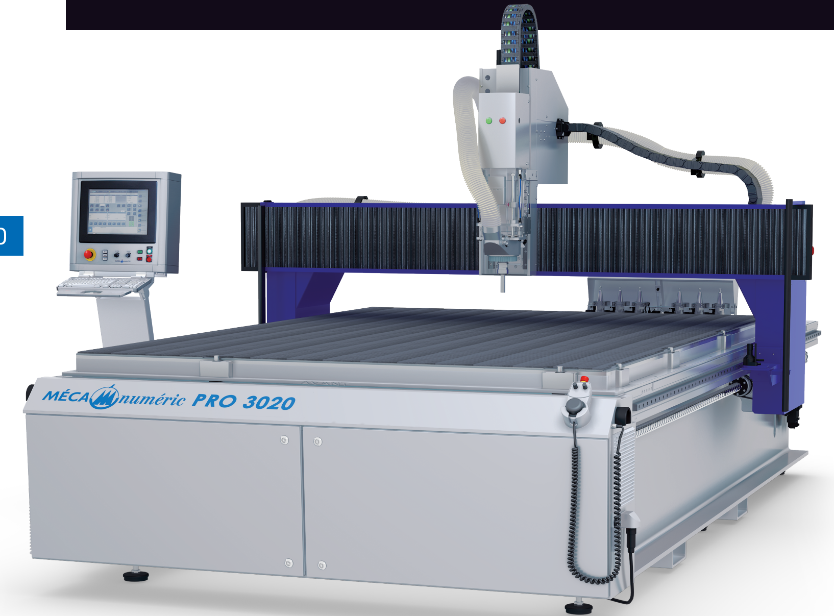
VERSATILE MILLING - MECAPRO 3020